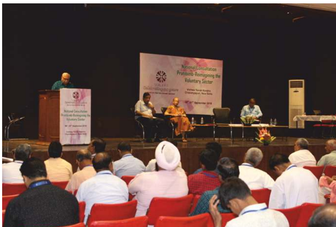
VANI's National Consultation held at Delhi

Civil Society Organisations (CSOs), across the globe are currently facing challenging times due to rapid changes in the socio-political and economic landscape. The civic space is dwindling; regulatory requirements are becoming harder and stifling, frequent negative portrayal in the media is affecting their image, raising questions on their credibility. They are being subjected to increased scrutiny. All these are in-turn affecting their resource availability and sustainability.