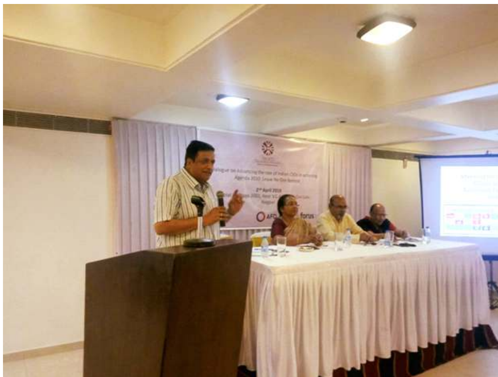
Dialogue on advancing the role of Indian CSOs in achieving agenda 2030