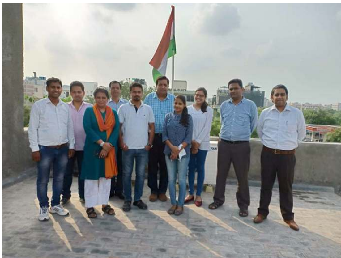
The vibrant and energetic team of VANI